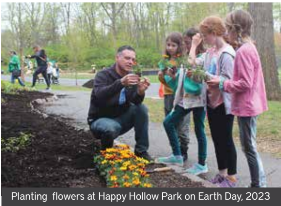
Planting flowers at Happy Hollow Park on Earth Day, 2023

also proud to support other local organizations, schools, and nonprofits, such as the Opportunity House in Reading and the John Paul II Center for Special Learning.