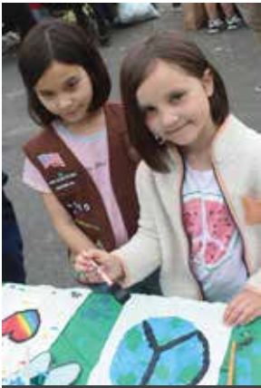
Earth Day Poster-Making

Lauren's Foundation believes in giving back to the community in ways that create and cultivate civic engagement. WE LOVE KIDS! They represent our future - that's why we support and provide resources for children's activities and programs offered and conducted by local municipalities. We are