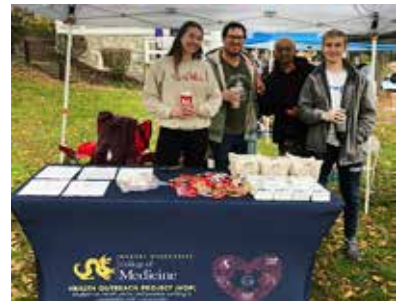
Drexel Health Outreach Project students

In 2021, a new Drexel connection was created when students at the newly established Drexel Medical School in West Reading reached out